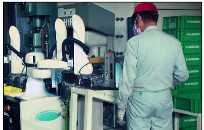
Kawasaki Duo robot tending of automotive drive train parts

Based on current safety standards (ISO-10218-1:2011 part 1 section 3.4) a collaborative operation is a state in which purposely designed robots work in direct cooperation with a human within a defined working space as in the photo below. In the simplest terms, a collaborative robot is defined as a robot that can be used in a collaborative operation. The next section (3.5) defines a collaborative work space as a working station within the safeguarded space where the robot and human can perform tasks simultaneously during production operations. So, what does this mean? It means any robot can be collaborative in terms of safety standards, and it is the task undertaken within the space that defines “collaboration.”