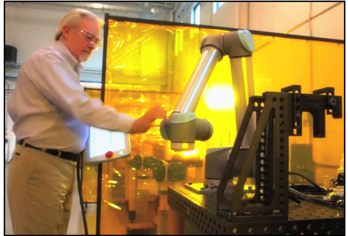
Testing the Universal Robot force settings

New cobots on the market require a focus on the fourth category of the new safety specifications, Power and Force Limiting. A new technical specification (ISO TS 15066) has been created to help guide collaborative robot users in determining safe and unsafe forces for power and force limitations. The technical specification contains the calculations needed to determine the energy being transferred during a collision. The calculations are based on the mass and velocity at the point of impact of the robot arm or an object being carried by the robot. The technical specification also contains tables that define the limit of forces that can be applied to different areas of the bodies without causing harm. Having calculated the forces that will be applied based on the list of hazards, the operator can cross reference the table and determine what limits need to be set up in the robot controller system.