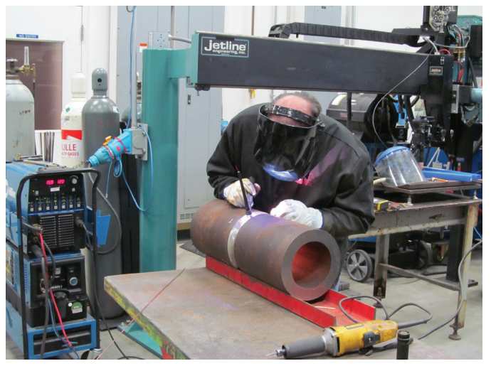
Figure 1. Inserting the tack welds at the root.

The testing plan was chosen to examine brittle fracture resistance at temperatures slightly below the lowest design temperatures that could be used for the welds. Testing was completed at -70°C and -50°C for both single-edge notch bending (SENB) and single-edge notch tension (SENT) crack tip opening displacement (CTOD) tests. The bending tests had greater constraint,