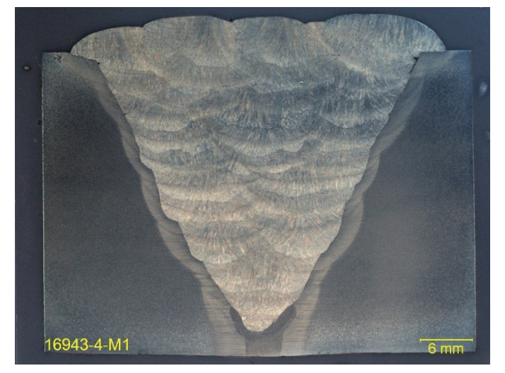
Figure 2. Cross-section of a girth weld.

Oil & Gas Strategic Technology Committee: Research for 2018