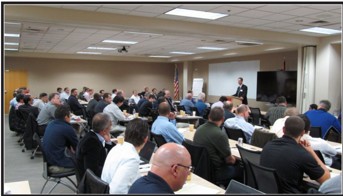
Advanced sheet metal forming technology workshop hosted at EWI Forming Center on Oct. 15, 2015

Presenters discussed technical challenges associated with advanced forming technologies and proposed solutions. Presentation topics included: